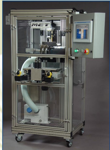
MET-10 for inserts