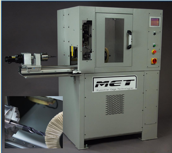
MET-2 Second Generation Versatility